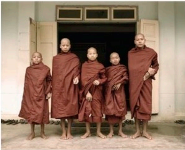
FIVE GENTLEMEN MYANMAR, 2009