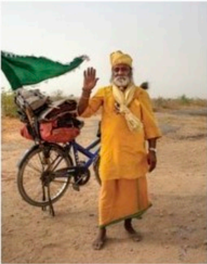
PILGRIM IN INDIA, 2009