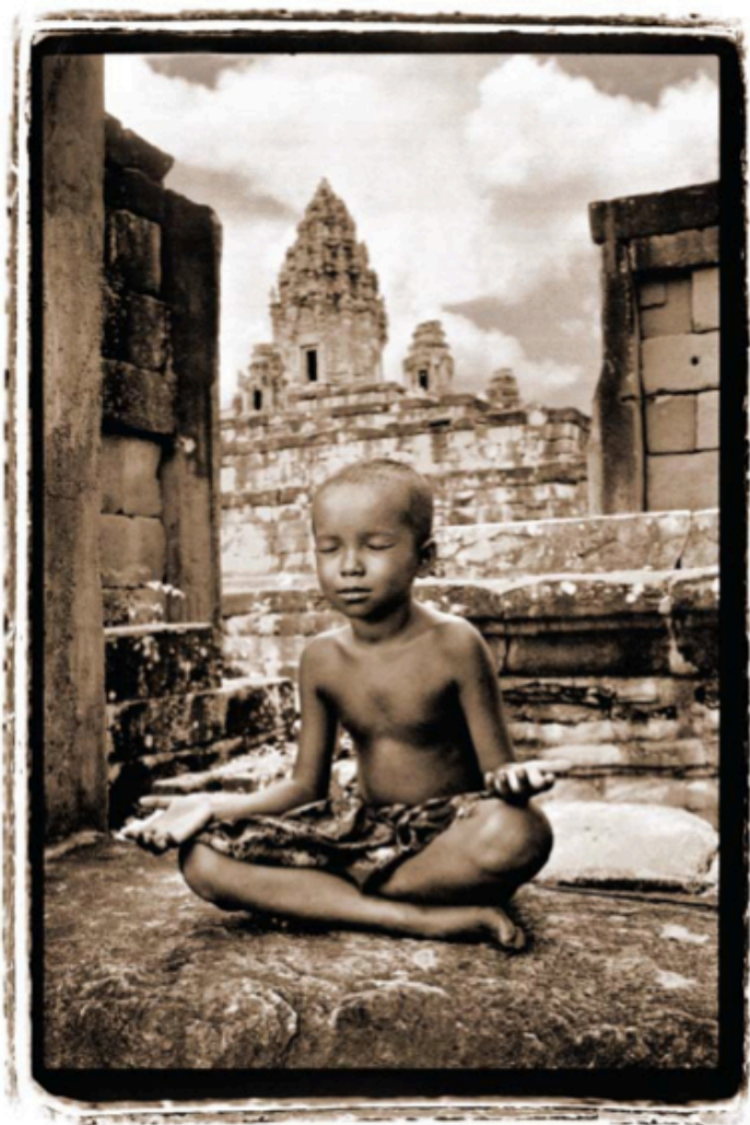
LITTLE BUDDHA CAMBODIA, 1998