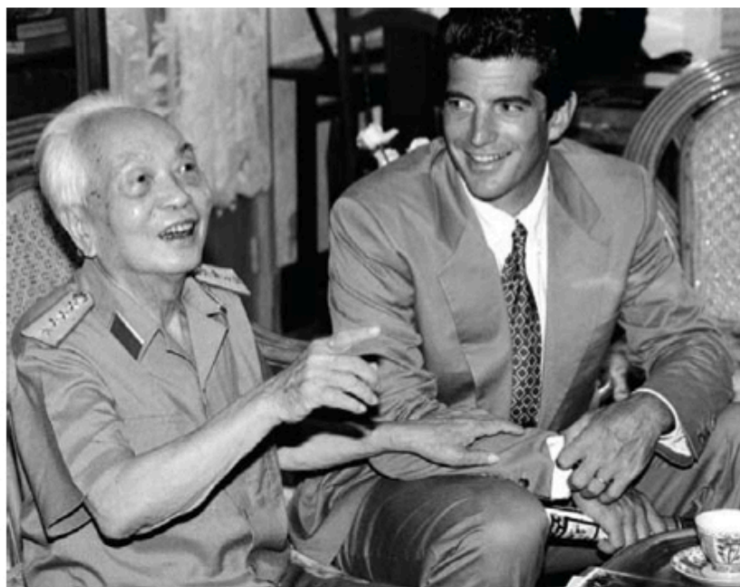
GENERAL GIAP AND JOHN F. KENNEDY, JR. HANOI, VIETNAM, 1998