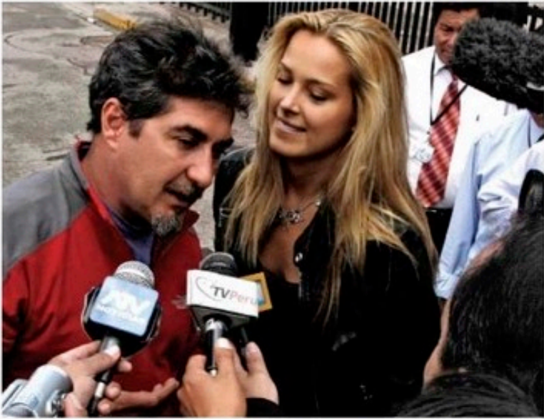
CUSCO, PERU FOR PRESS CONFERENCE WITH PETRA NEMOCOVA, 2008