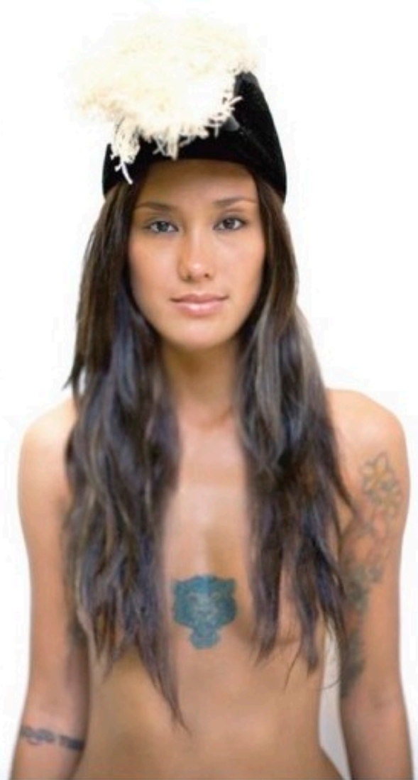
FA NEPOLEON BALI, 2008