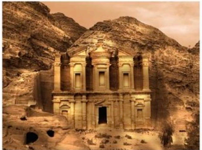
PETRA MONASTARY JORDAN, 2005